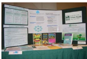
CUHI Exhibit at the ICUH, Toronto, October 26-28, 2005